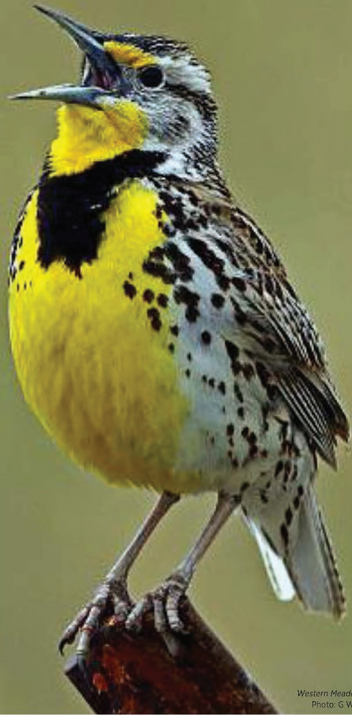
Western Meadowlark