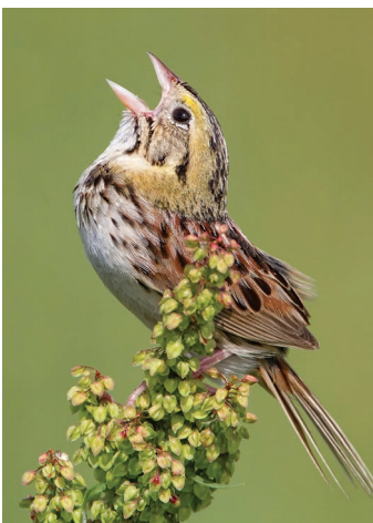
Many Henslow's sparrows were once again seen this summer.