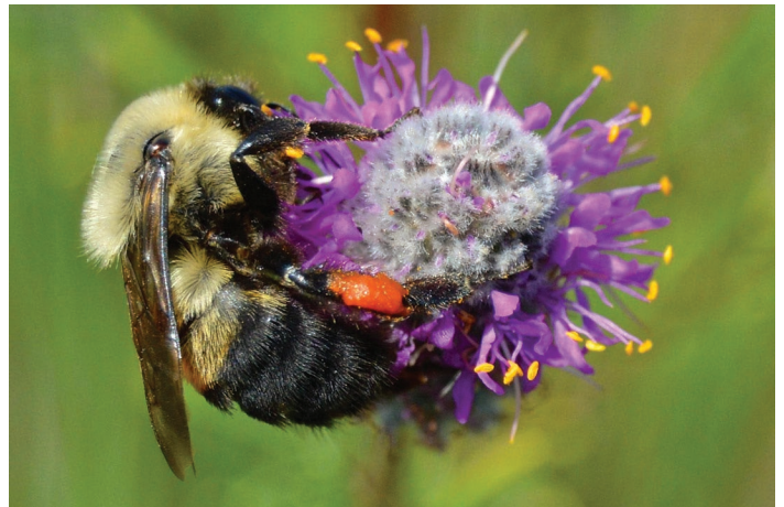
A common wild bee in Nebraska, a brown-belted bumble bee visits a purple prairie clover.

Being the fortunate graduate student chosen to take on the pollinator research, it has become my job to frolic the lengths of the Prairie Corridor — net in hand — in search of wild bees. Throughout the corridor I sample 20 different plots, representing prairies under various land management techniques, for plant-pollinator interactions. During 2017 and 2018, sampling occurs every two weeks from April to October and consists of surveys of flowering plants and wild bees. Collecting this data will allow us to analyze potential flower preference displayed by wild bees, locate patterns between flowering-